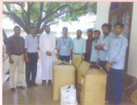
College student senate office bearers and members of staff with the Director, Pope Paul Mercy home

the inhabitants of Pope Paul Mercy Home, Athani. The same was handed over to the Director of Pope Paul Mercy Home on 12 April 2011